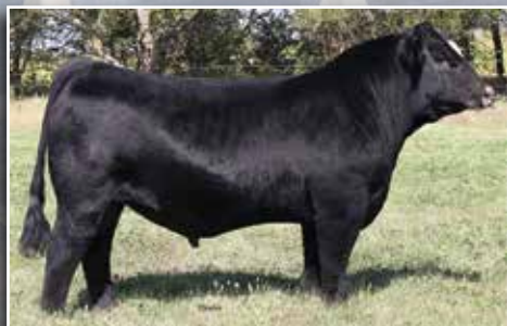
Mr CCF 20-20