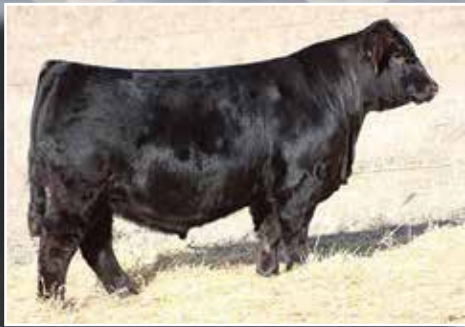
W/C Executive Order