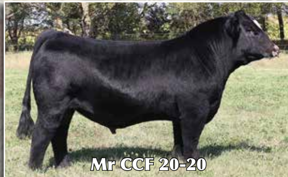
Mr CCF 20-20