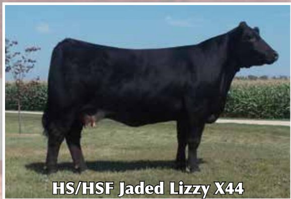
HS/HSF Jaded Lizzy X44