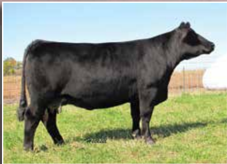
SVF/BT Sazerac Y702