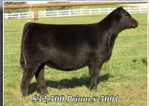
$32,500 Primo x 5001