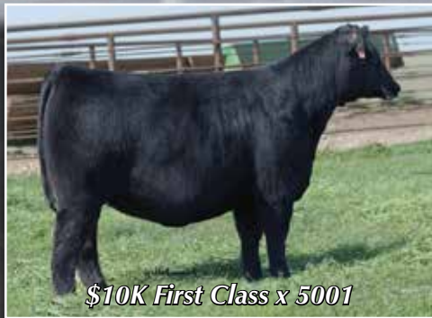
$10K First Class x 5001