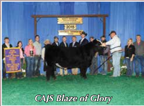
CAJS Blaze of Glory