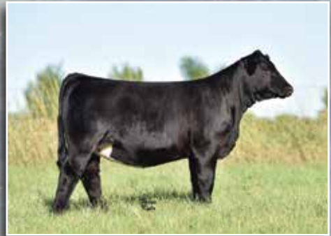
JRB/HSF Jenessa E125 $10,500 Broker x Hannah W986