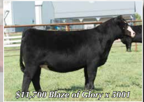
$11,700 Blaze of Glory x 5001