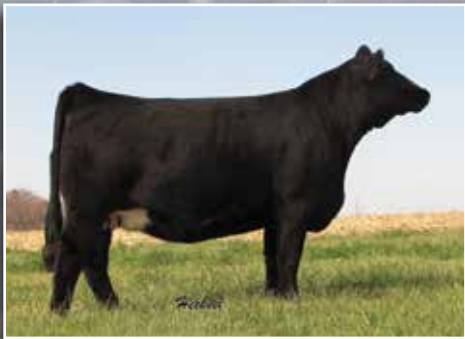
HSF Hannah W986