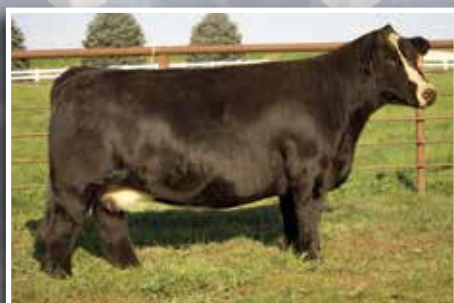
JSC/RSF Maxi Belle 1U