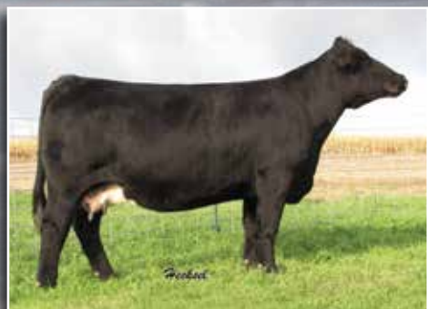
HSF Hannah Montana