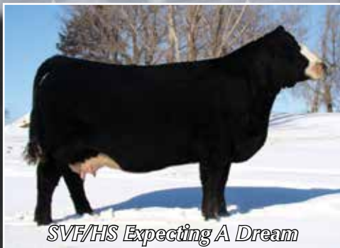
SVF/HS Expecting A Dream