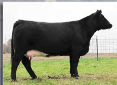
HSF Carmella B410