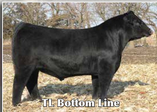
TL Bottom Line