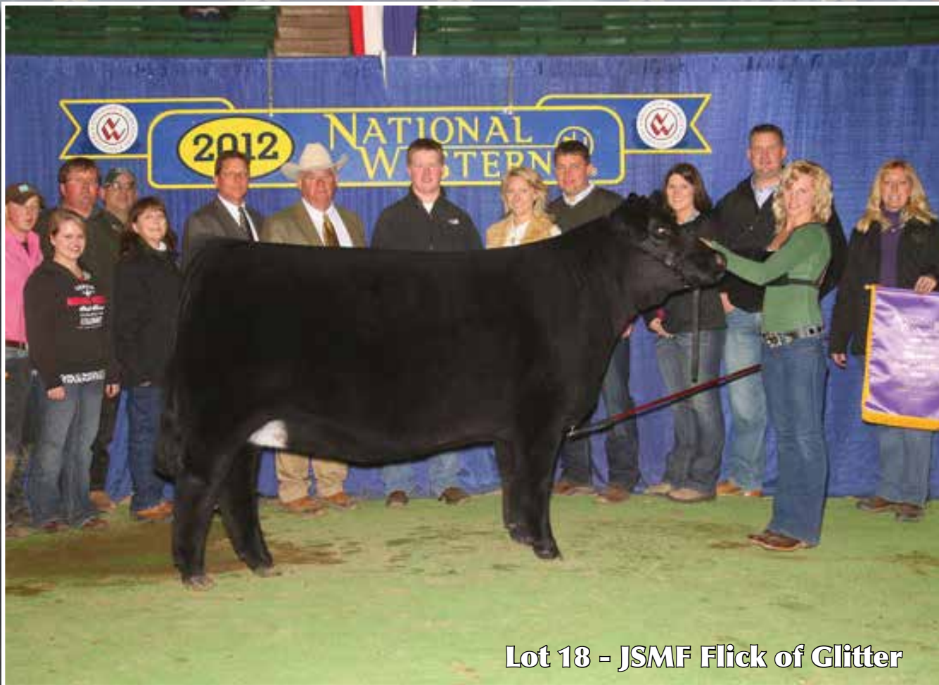
Lot 18 - JSMF Flick of Glitter