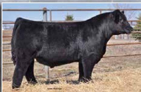
W/C No Remorse