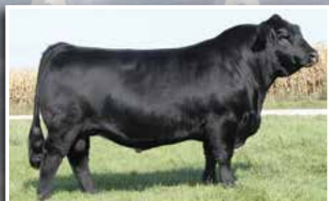
WLE Uno Mas